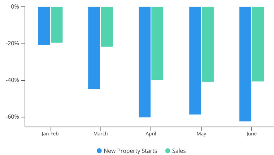
Figure 1. New Property Starts Plummeted 60% Compared to June 2021