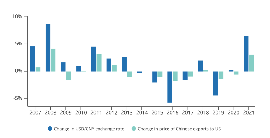
Figure 3. Currency Depreciation Doesn't Lead to Equival Declines in Export Prices

During the 2015 slowdown, Chinese export prices fell only ~2% even though the yuan depreciated by ~6%, likely because a large share of Chinese exports <u>are priced in</u> US dollar (see Figure 3). Moreover, Chinese exports to the United States only account for 2% in US consumer inflation. As such, China's slowdown may help inflation at the margins, but it will probably have a negligible impact on energy prices in the near term.